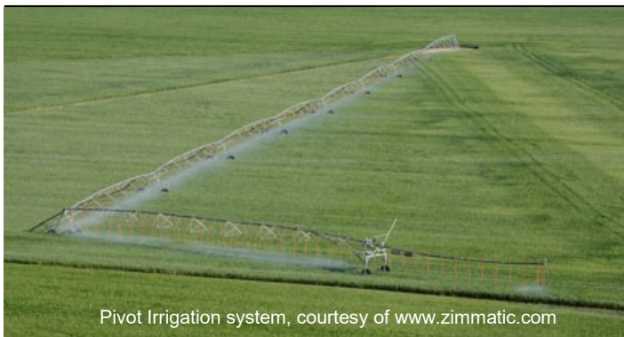
Pivot Irrigation system

Water licenses are required as per the Water Sustainability Act and can be obtained through the relevant Ministry (FLNRO & Rural Development), in order to ensure that sufficient water is retained for environmental and wildlife purposes. In addition, prior users of the water source need to be considered. Construction of access and pipelines across public lands will require permission from the relevant government departments.