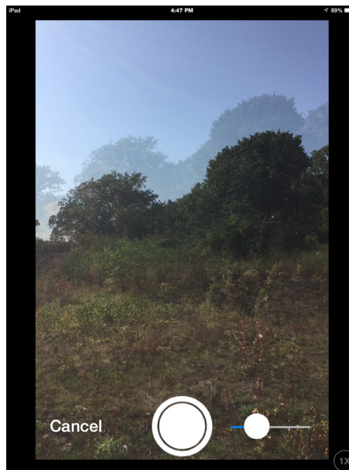
Figure 2. The ghost image feature allows the user to line up the current photo with the previous photo. This feature ensures that the new image is taken in the same place and position as before, so a consistent photographic record can be maintained.

RxBurnTracker is a tool land managers can use to observe and document the regrowth of vegetation following a prescribed fire. RxBurnTracker is a simple way for land managers to see short-term progress within their long-term prescribed fire management goals. This app is also a great way for land managers to know where they are relative to their management goals and, more importantly, to show them where they have been.