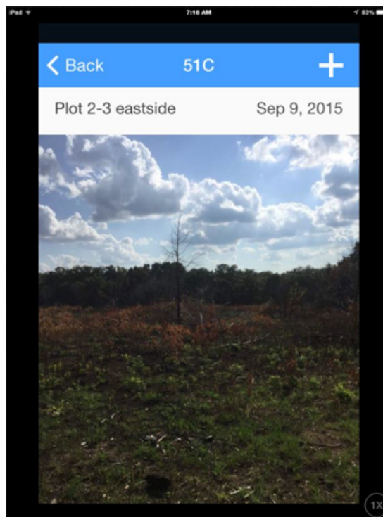
Figure 3. RxBurnTracker allows users to maintain a consistent photographic record of before and after prescribed burn treatments. These pictures were taken 15 days apart to show regrowth following a growing season burn.

Oklahoma State University, in compliance with Title VI and VII of the Civil Rights Act of 1964, Executive Order 11246 as amended, and Title IX of the Education Amendments of 1972 (Higher Education Act), the Americans with Disabilities Act of 1990, and other federal and state laws and regulations, does not discriminate on the basis of race, color, national origin, genetic information, sex, age, sexual orientation, gender identity, religion, disability, or status as a veteran, in any of its policies, practices or procedures. This provision includes, but is not limited to admissions, employment, financial aid, and educational services. The Director of Equal Opportunity, 408 Whitehurst, OSU, Stillwater, OK 74078-1035; Phone 405-744-5371; email: eeo@okstate.edu has been designated to handle inquiries regarding non-discrimination policies; Director of Equal Opportunity. Any person (student, faculty, or staff) who believes that discriminatory practices have been engaged in based on gender may discuss his or her concerns and file informal or formal complaints of possible violations of Title IX with OSU's Title IX Coordinator 405-744-9154.